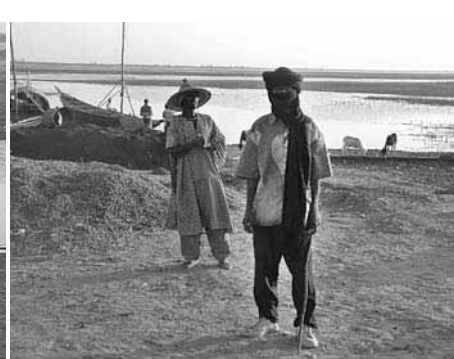
Timbuktu is located where the Niger flows north into the southern edge of the desert, making the town a place where 'camel meets canoe'. From at least as early as the eleventh century, Timbuktu has been an important port for trade between West and North Africa.

However, there was clearly a need for more resources and skills development. In terms of contemporary standards of conservation there was a huge and growing gap between what was required as the ageing paper record deteriorated, and the very little that was being done to protect this precious legacy.