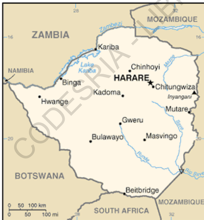
Figure 4.1: Map of Zimbabwe showing city of Harare

The market that is the subject of this study is situated in Harare, the capital city of Zimbabwe which is located in the north east of the country (Figure 4.1).